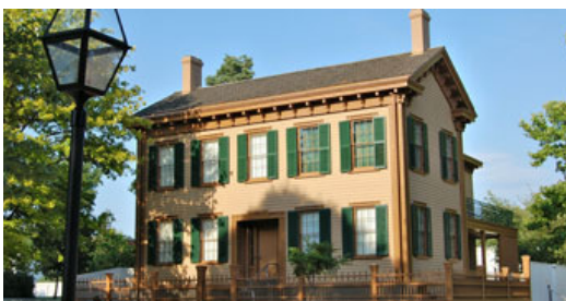
Lincoln's Home in Springfield

Save the date! We have planned a one-day trip to Springfield, Illinois, to celebrate the year of Abraham Lincoln's 200 th birth! We will be taking a deluxe tour bus with comfortable seats, a bathroom and DVD players for our own use. The itinerary includes a visit to the Lincoln Presidential Museum, the Old State Capitol Building, Lincoln's home and viewing of Lincoln's Tomb and the war memorials. The trip is scheduled for Wednesday, September 16, 2009 . The trip costs $90.00 per person which includes the bus, all the tours while in Springfield, and dinner. You will be responsible for your own lunch. We have planned two seminars on Lincoln to be held at the Senior Center in the weeks prior to the trip to share information on Lincoln and to preview what you will see. We need a minimum of 40 people for this trip. Look for more details in the August newsletter.