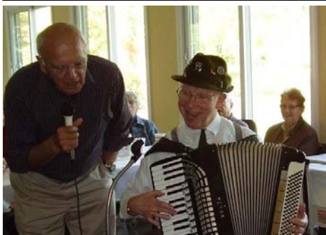
Oktoberfest with The Happy Wanderer